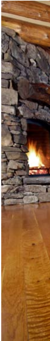
Mountain retreat. Carlisle Country Grade Cherry -