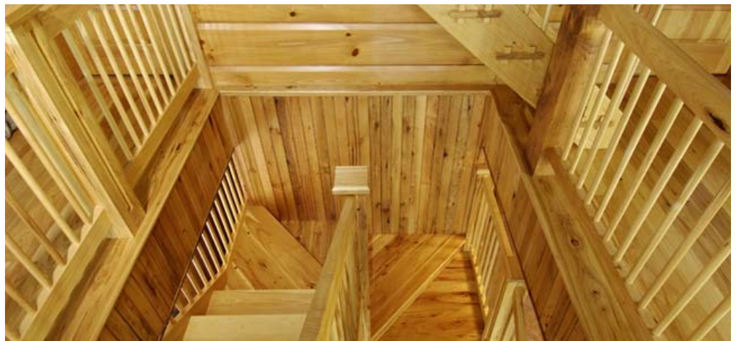
Top: Carlisle feather and beaded eastern white pine paneling and country grade hickory floor. Radiant heat used throughout. Alton, New Hampshire

Precision end-squaring is also available. Carlisle can supply your complete floor with all planks pre-end-squared to save you time and money installing your floor.