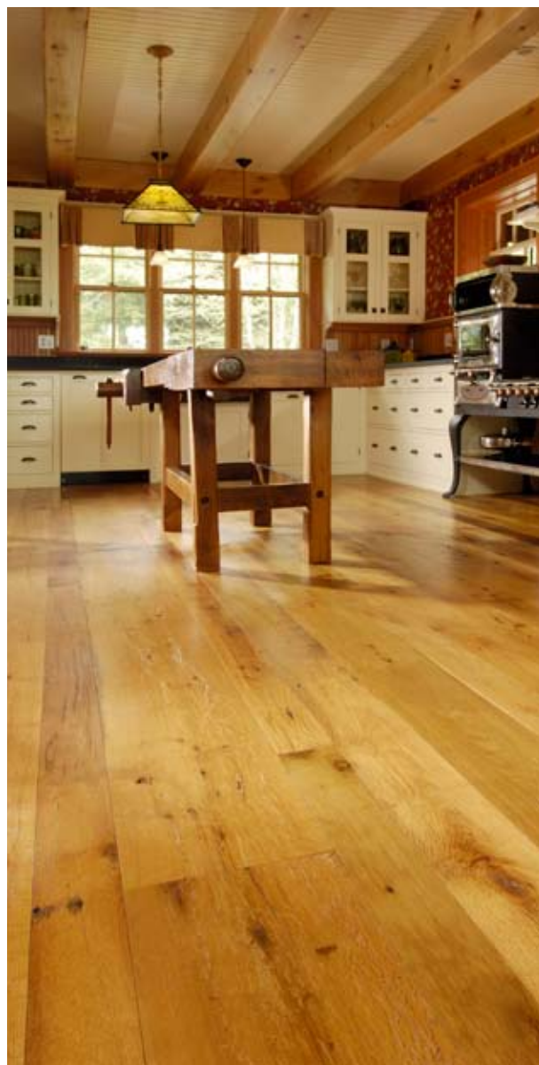
FSC Certified Carlisle Antique Oak—Moultonborough, NH.