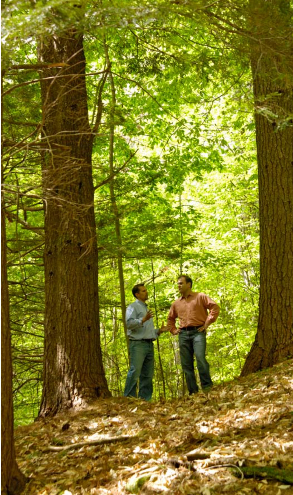
caption for above photo

By harvesting these old growth timbers, younger trees have greater access to sunlight, water and nutrients, which are necessary components for their own growth.