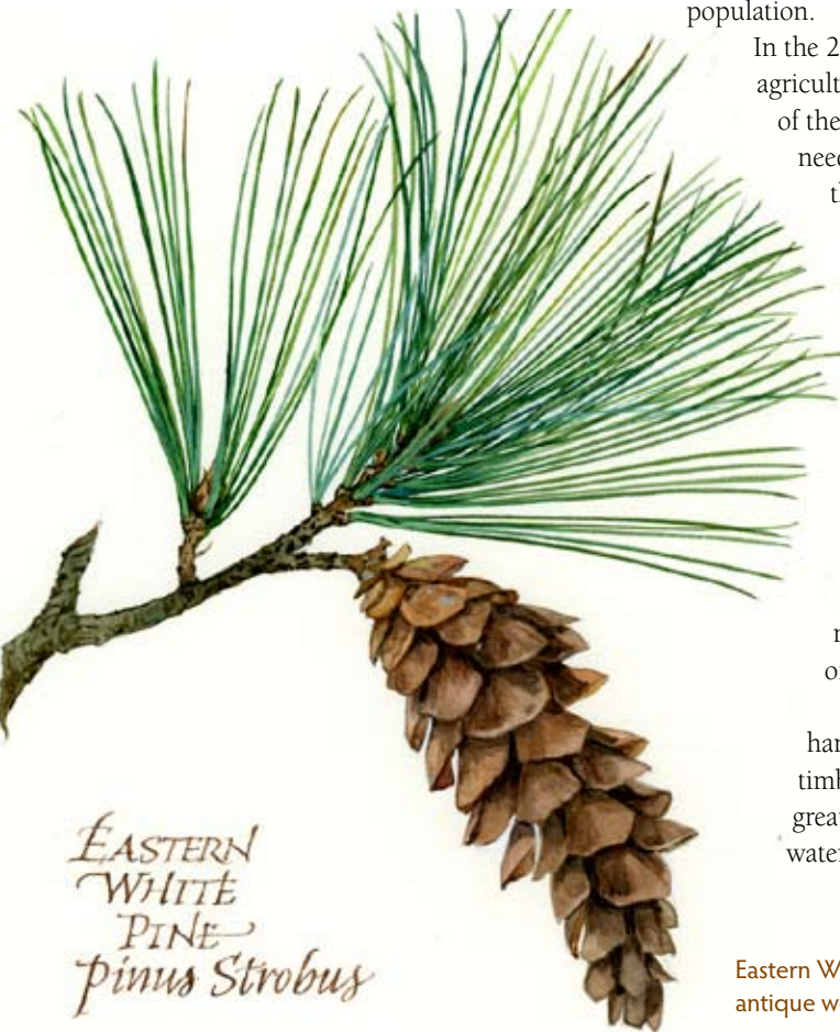
EASTERN WHITE PINE Pinus Strobus

We believe that our traditional wide plank floors pay homage to these majestic timbers, the craftsman that initially worked with them, and the sustenance of our forests.