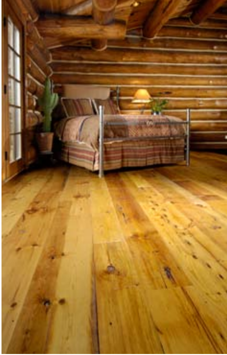
Carlisle Antique Milled Barn Wood - Jackson, Wyoming