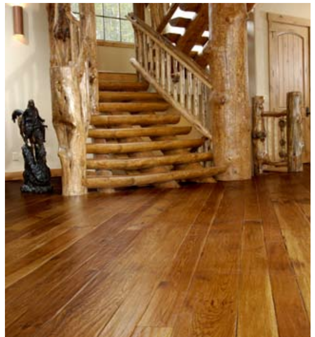
Right: Carlisle Country Grade Hickory with hand sculpted surfaces and edges. Grand Lake, Colorado