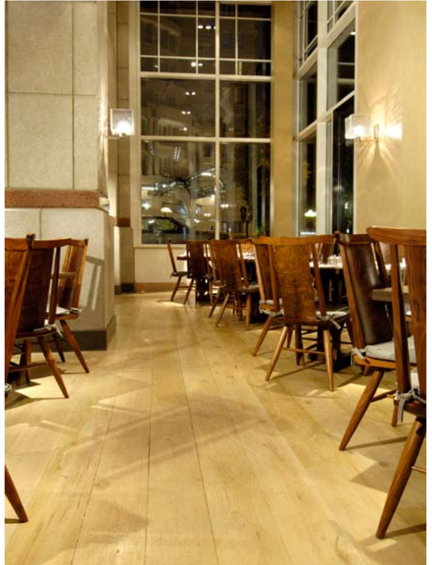
Upscale, but with country comfort. Carlisle County Grade White Oak bleached. Installed over concrete. Park Hyatt Hotel - Washington, DC

demands, they are a result of our commitment to our core company principles of sustainability and stewardship. Through careful selection and harvesting, the sawyers we source our wood from ensure that the forests will be here for generations to come. It has always been our practice to use as much of the log as possible while manufacturing our floors. Each order is custom and is generated as a result of the relationship our design and sales consultants have built with customers. Our craftsmen take the time necessary to make artistic