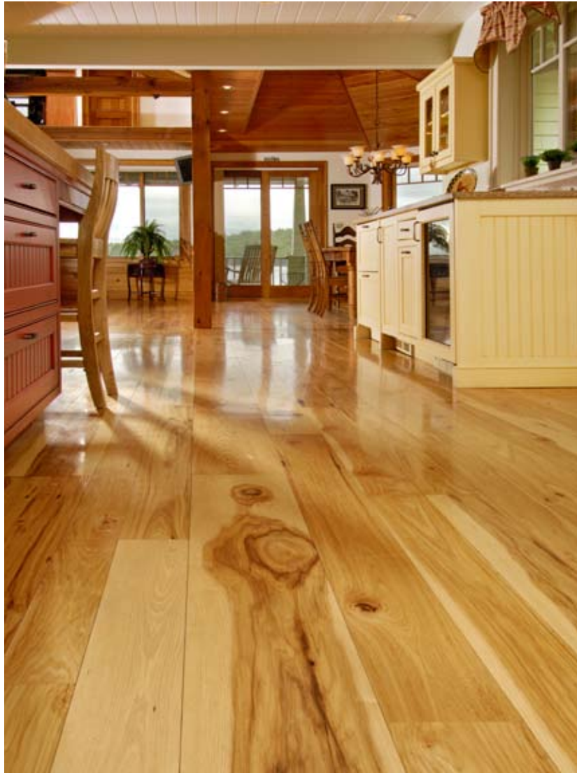
Cottage on the lake. Comfortable, and built for traffic. Carlisle Country Grade Hickory with Tung Oil - Alton, New Hampshire

You can take the most rustic wood and use it in an upscale city dwelling or the most formal wood and use it in a rustic cottage. It's all about you...and your lifestyle. You can further refine the individual look by choosing between a select, premium, and country grade look depending on how much character (grain, knots, cracks, checks, holes, etc.) you desire in your floor.