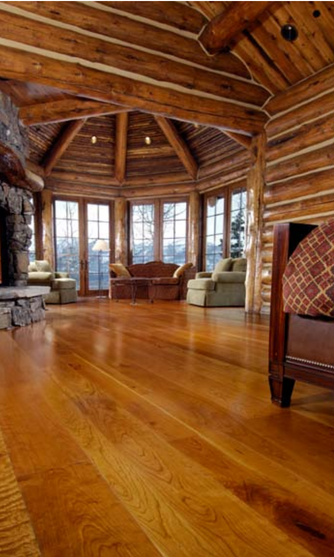
Thin-aided luxury and secluded elegance. Carlisle Country Jackson, Wyoming